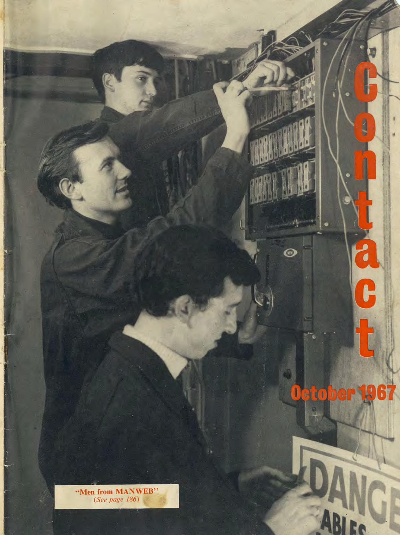
"Men from MANWEB" (See page 186)