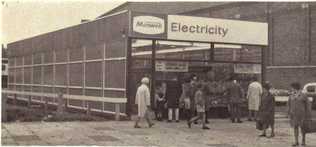
The new MANWEB Shop in Broadway, Liverpool.