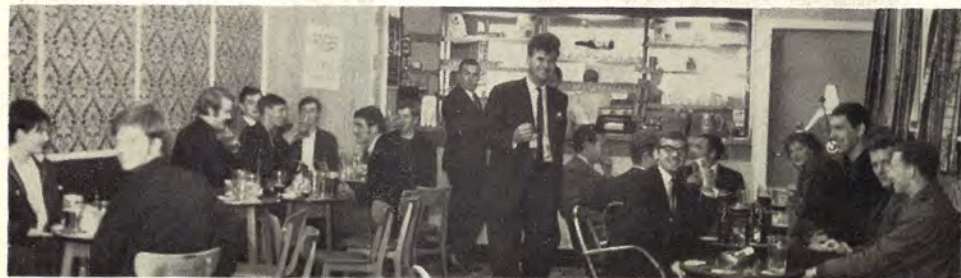
and in the main bar... which is away from the Clubroom