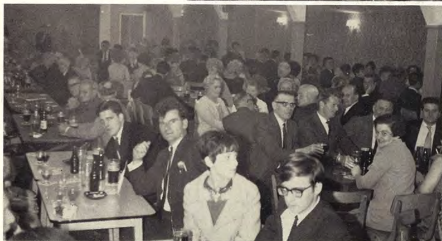
A general view of the comfortable surroundings in the tastefully decorated Clubroom. New members and their subscriptions are always welcome.