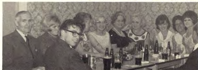
A smoke-laden picture taken at one of the tables.